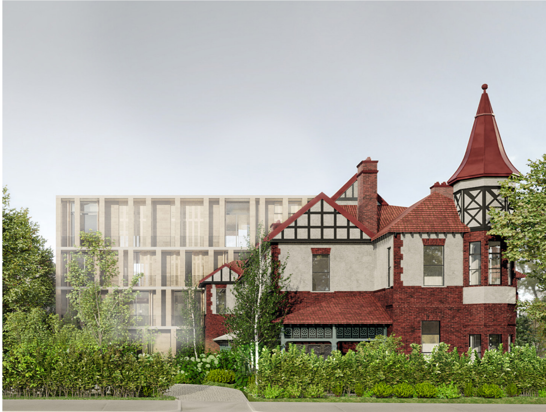
View from Albert St

HV RFI 01 - ADDENDUM 01 30 OCT 2024 3D VISUALS