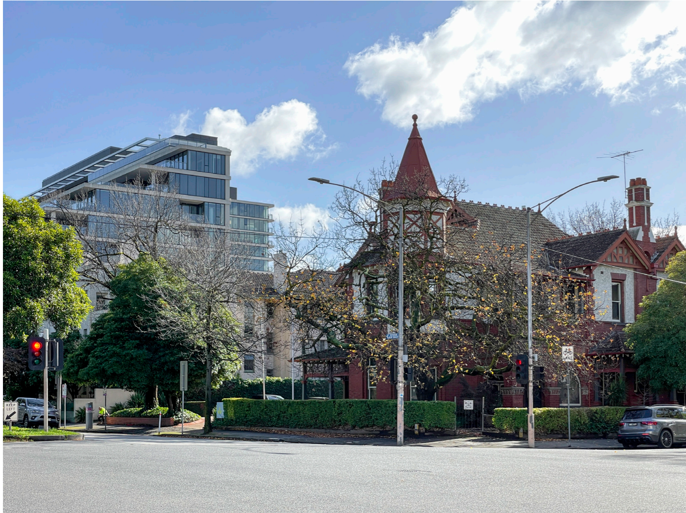
Existing conditions view from Albert Street & Clarendon Street intersection