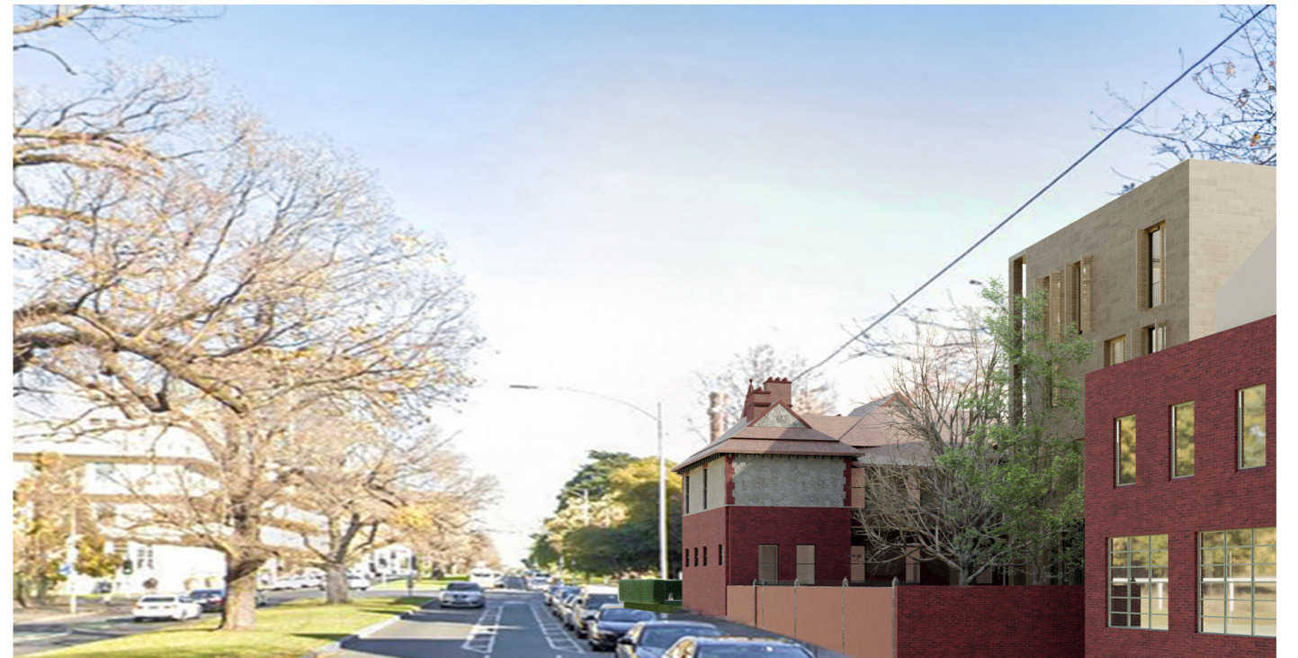
View from Clarendon Street - Proposed Building