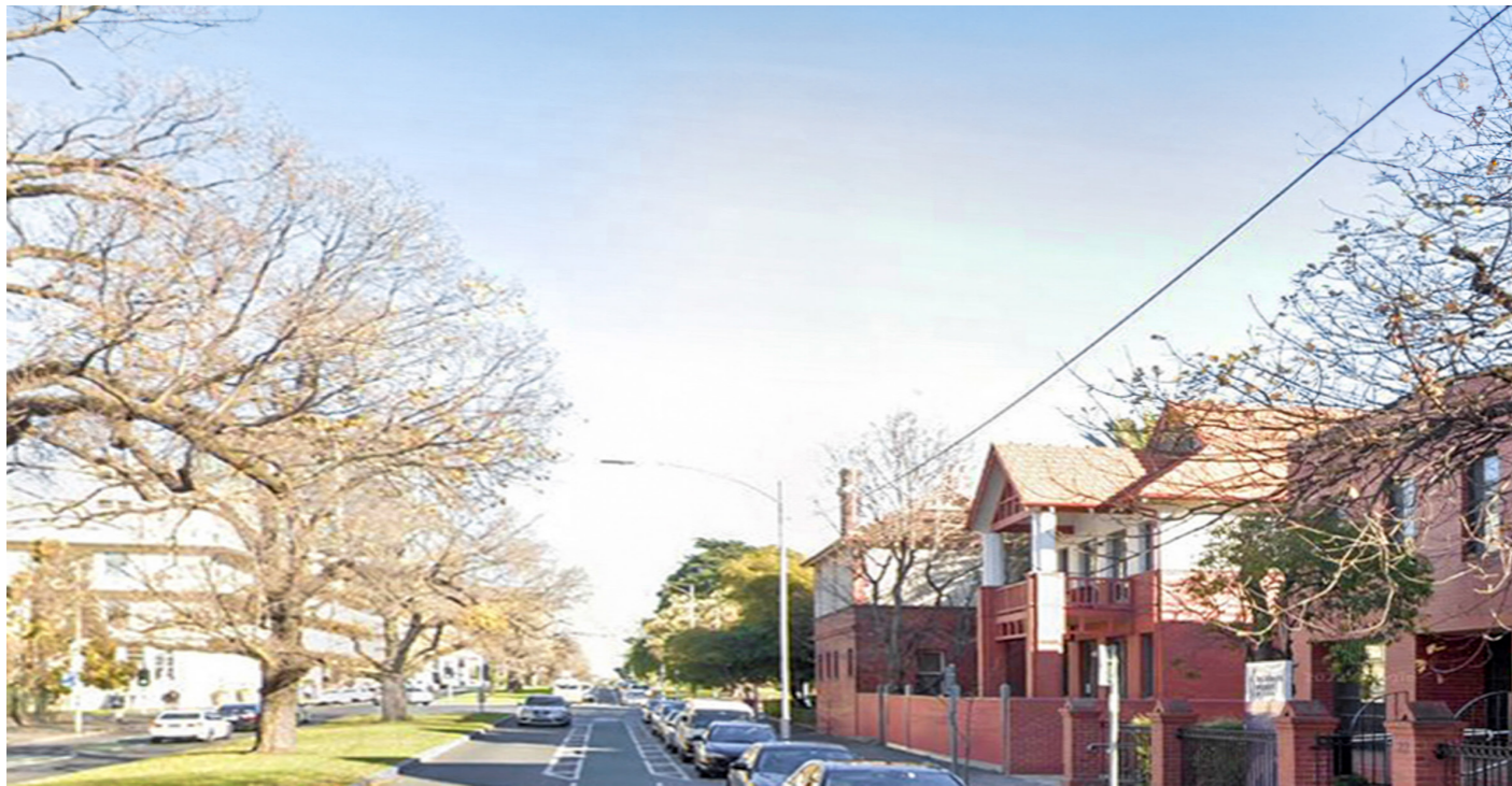
View from Clarendon Street - Existing Rear Extension