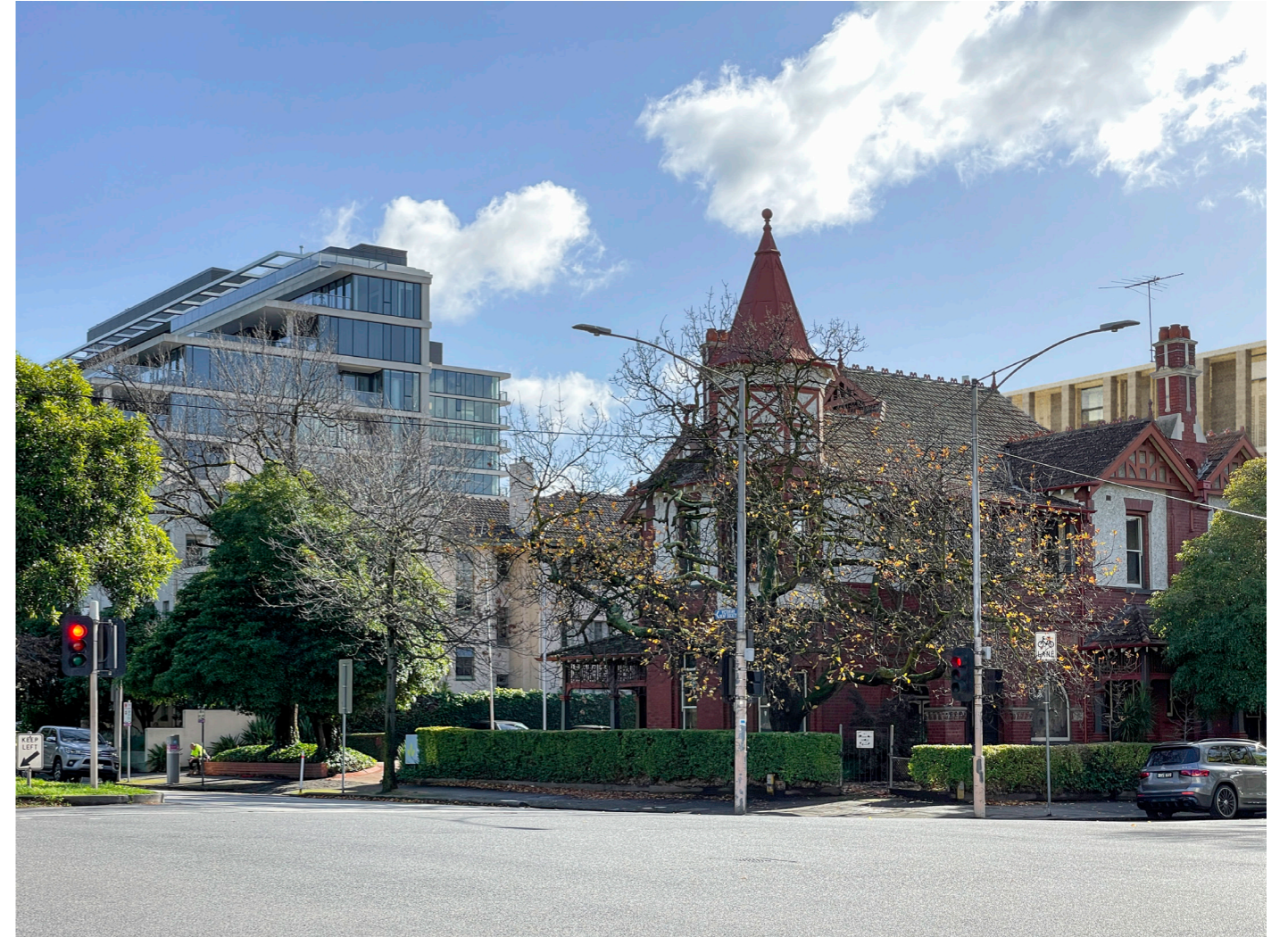
View from Albert Street & Clarendon Street intersection with proposed new building

HV RFI 01 - ADDENDUM 01 30 OCT 2024 3D VISUALS