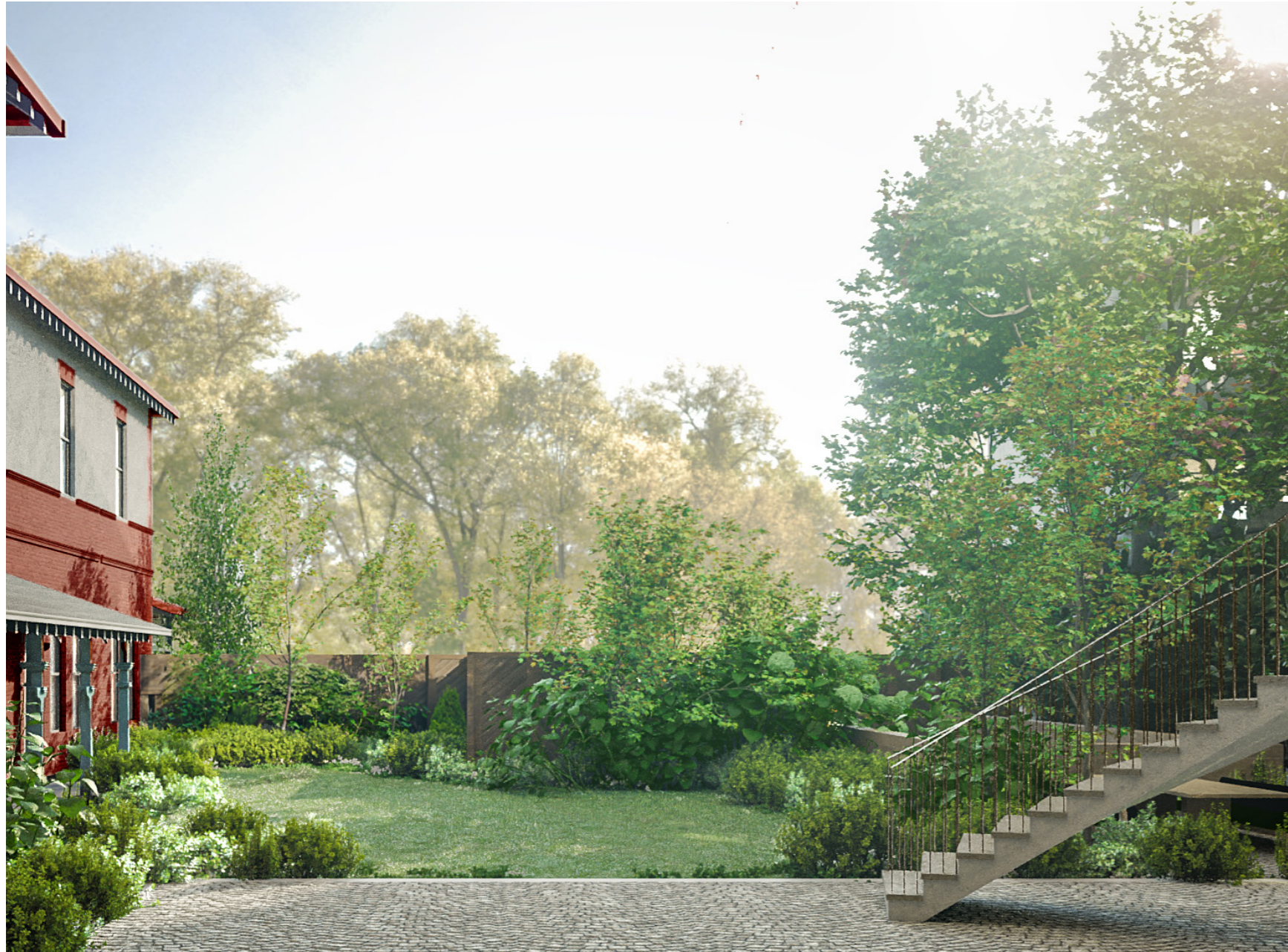
View to St Hilda garden