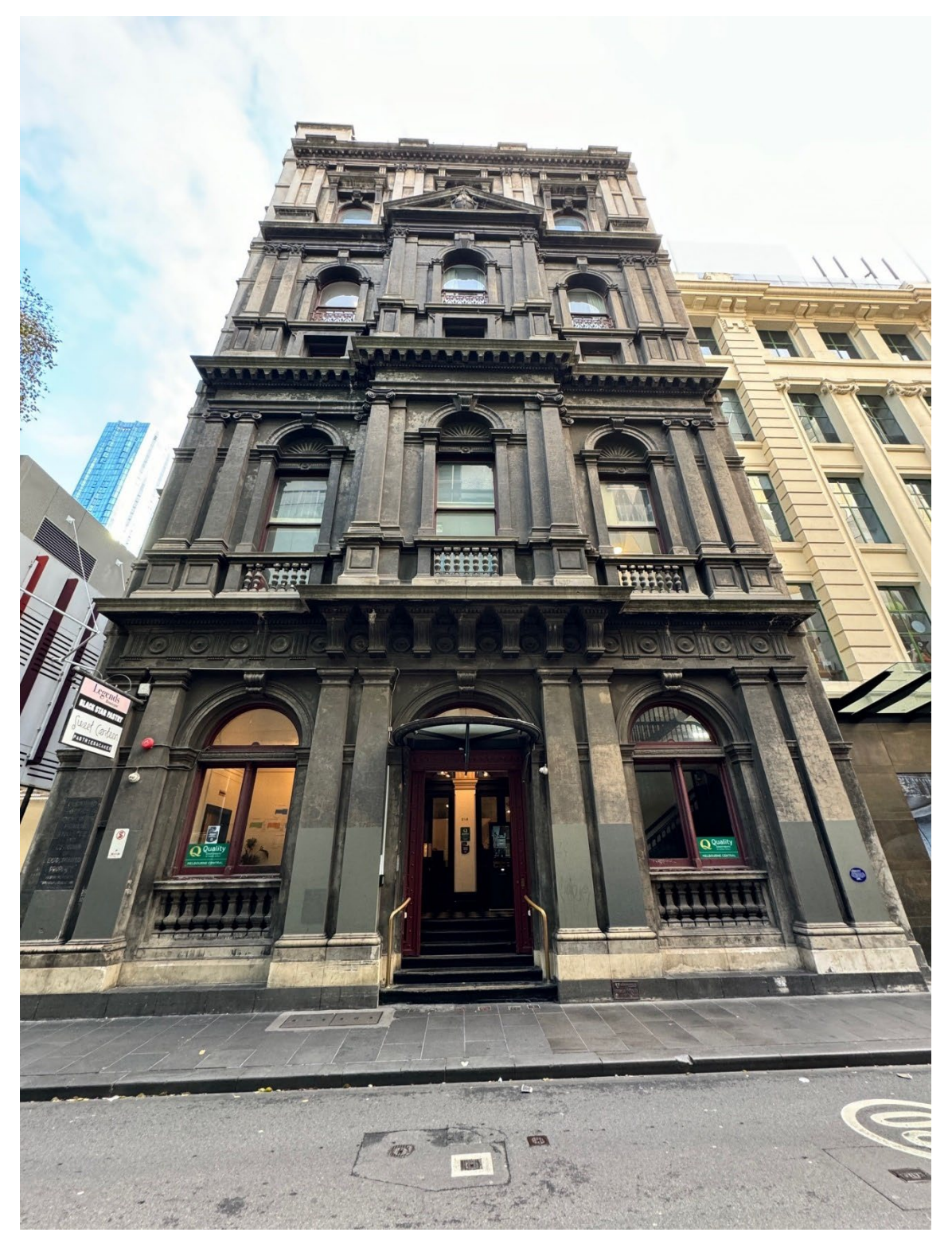
The former Money Order Post Office and Savings Bank 318 Little Bourke Street