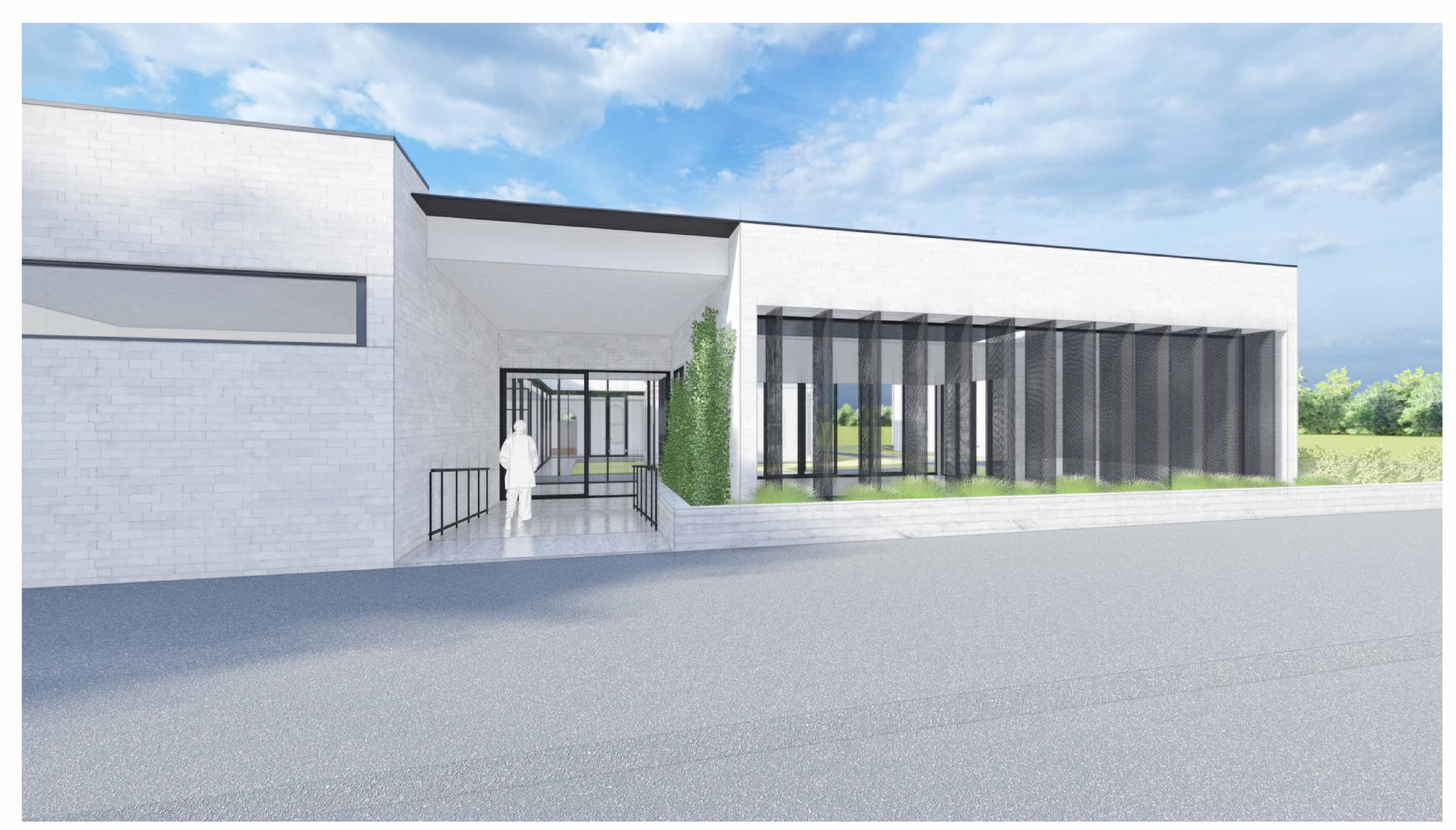
Rotatable sun shading element devices Open - Winter setting