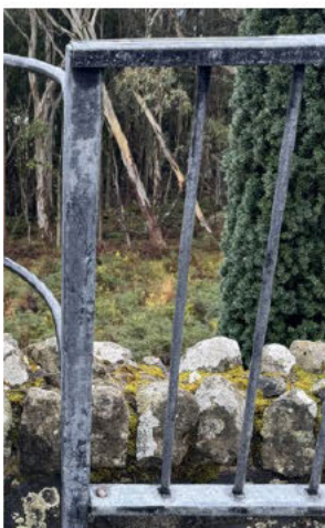
Existing balustrade colour

The paint colour is to be a grey to matches the colour of the gum tree trunks, similar to the existing balustrade, in order to visually blend into the background of the forest. The colour will be Dulux Shale Grey or similar. The exact shade is to be determined on site to achieve the lowest visual impact.