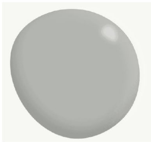
Dulux Shale Grey