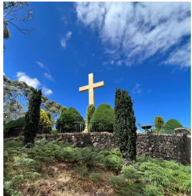
Figure 23 Exterior view of podium and Cross.