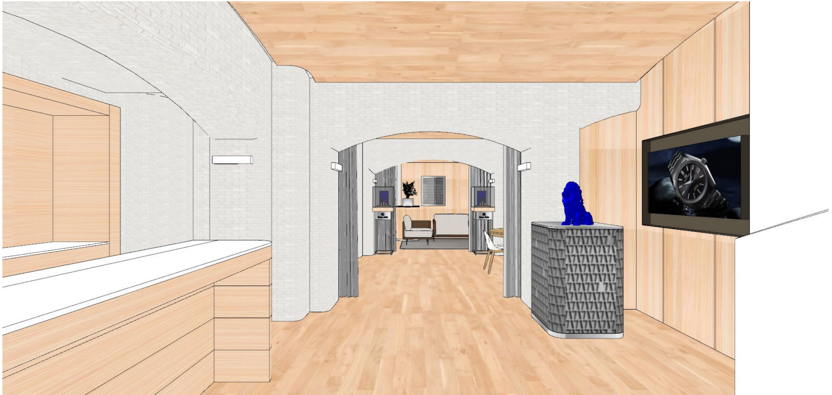
Internal Perspective – Basement : Vestibule

PROPOSED GRAND SEIKO BOUTIQUE HERITAGE VICTORIA ISSUE – GF & MEZZ PERSPECTIVES SHOP 286 THE BLOCK ARCADE 282 COLLINS ST MELBOURNE VIC 29.05.2024