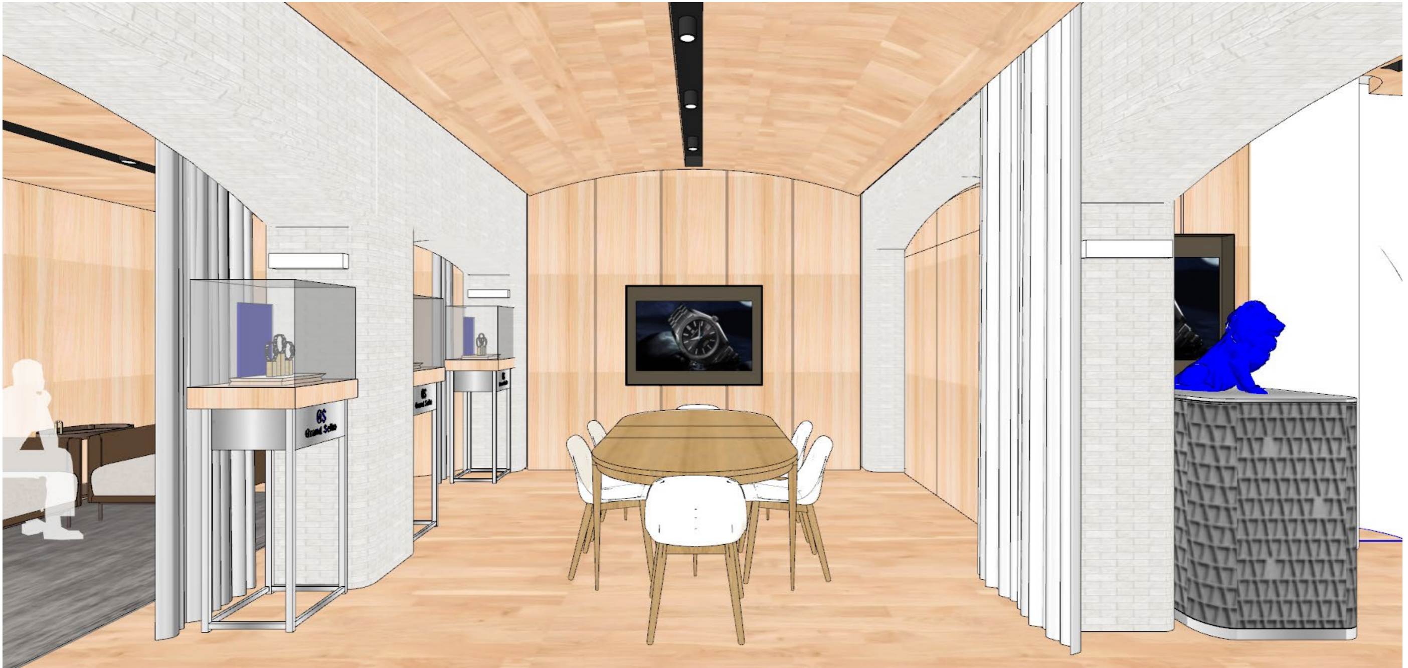
Internal Perspective – Basement : Multipurpose room

PROPOSED GRAND SEIKO BOUTIQUE HERITAGE VICTORIA ISSUE – GF & MEZZ PERSPECTIVES SHOP 286 THE BLOCK ARCADE 282 COLLINS ST MELBOURNE VIC 29.05.2024