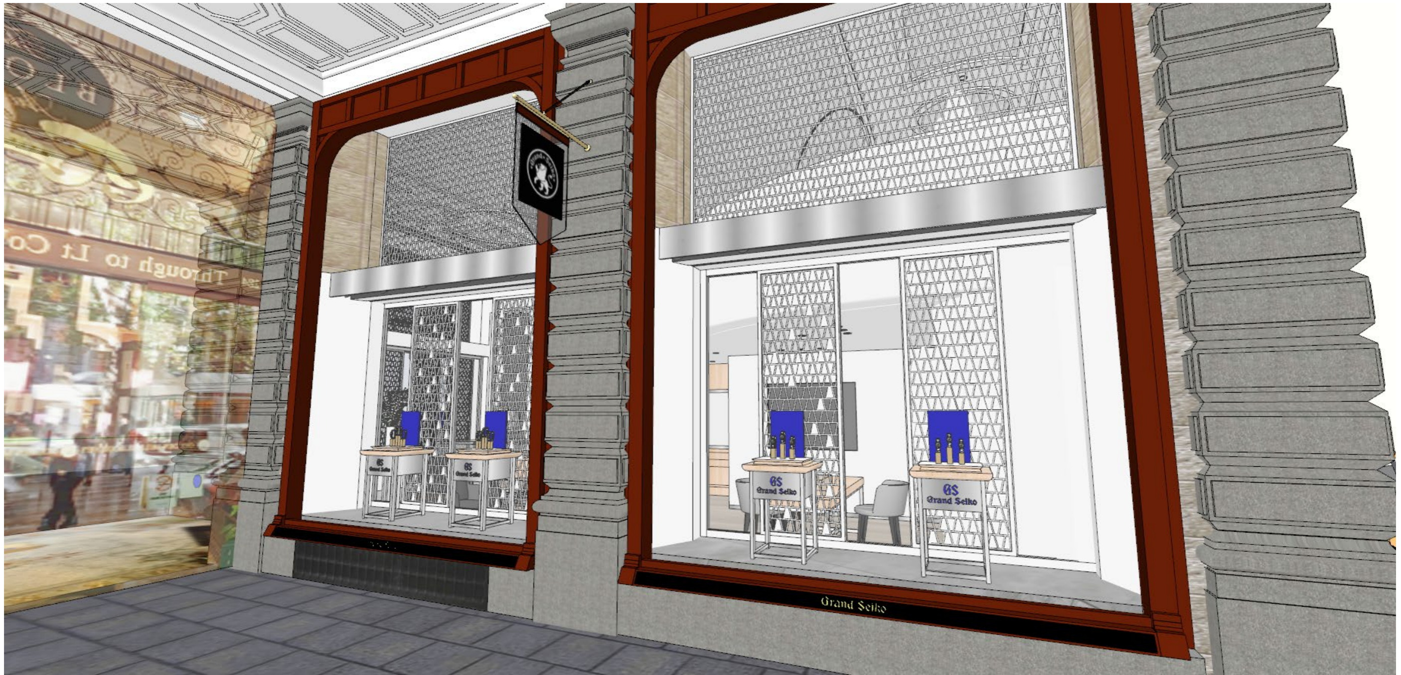
Shopfront Perspective – Block Arcade

PROPOSED GRAND SEIKO BOUTIQUE HERITAGE VICTORIA ISSUE (REV A) – GF & MEZZ PERSPECTIVES SHOP 286 THE BLOCK ARCADE 282 COLLINS ST MELBOURNE VIC 12.07.2024