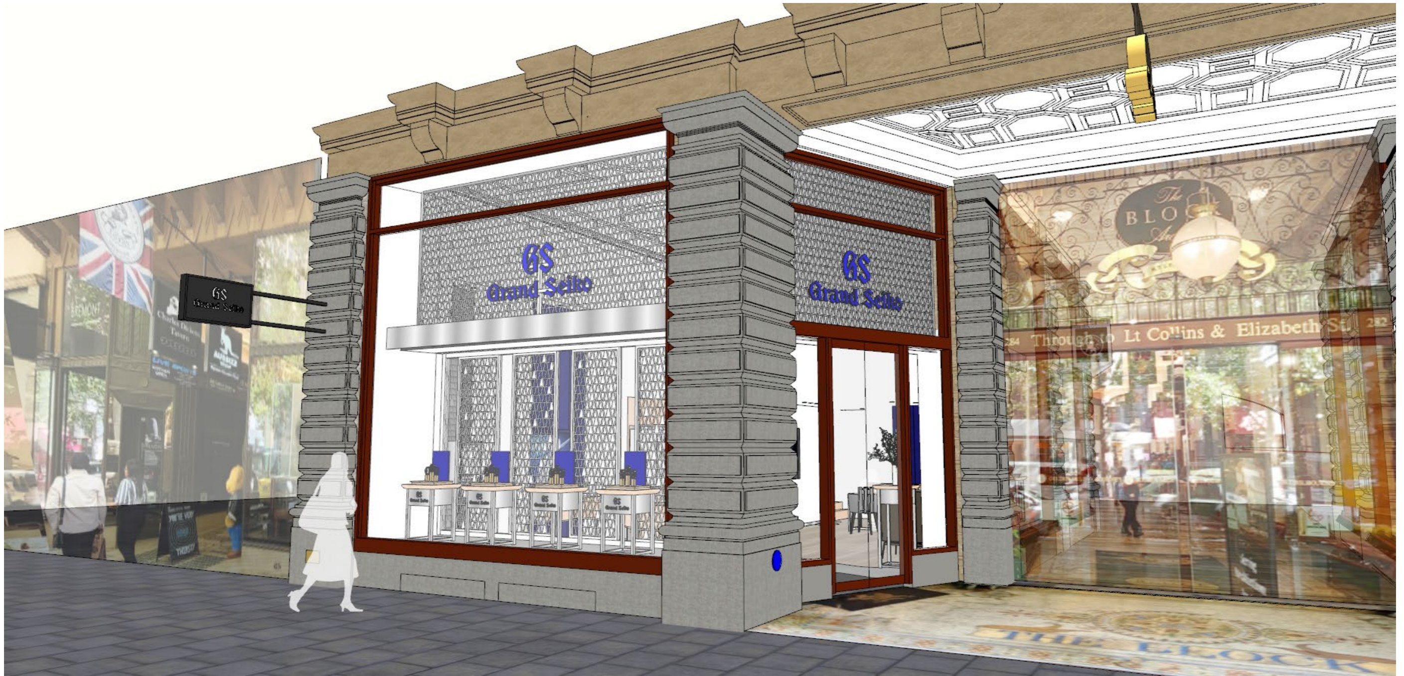
Shopfront Perspective – Collins St

PROPOSED GRAND SEIKO BOUTIQUE HERITAGE VICTORIA ISSUE (REV A) – GF & MEZZ PERSPECTIVES SHOP 286 THE BLOCK ARCADE 282 COLLINS ST MELBOURNE VIC 12.07.2024