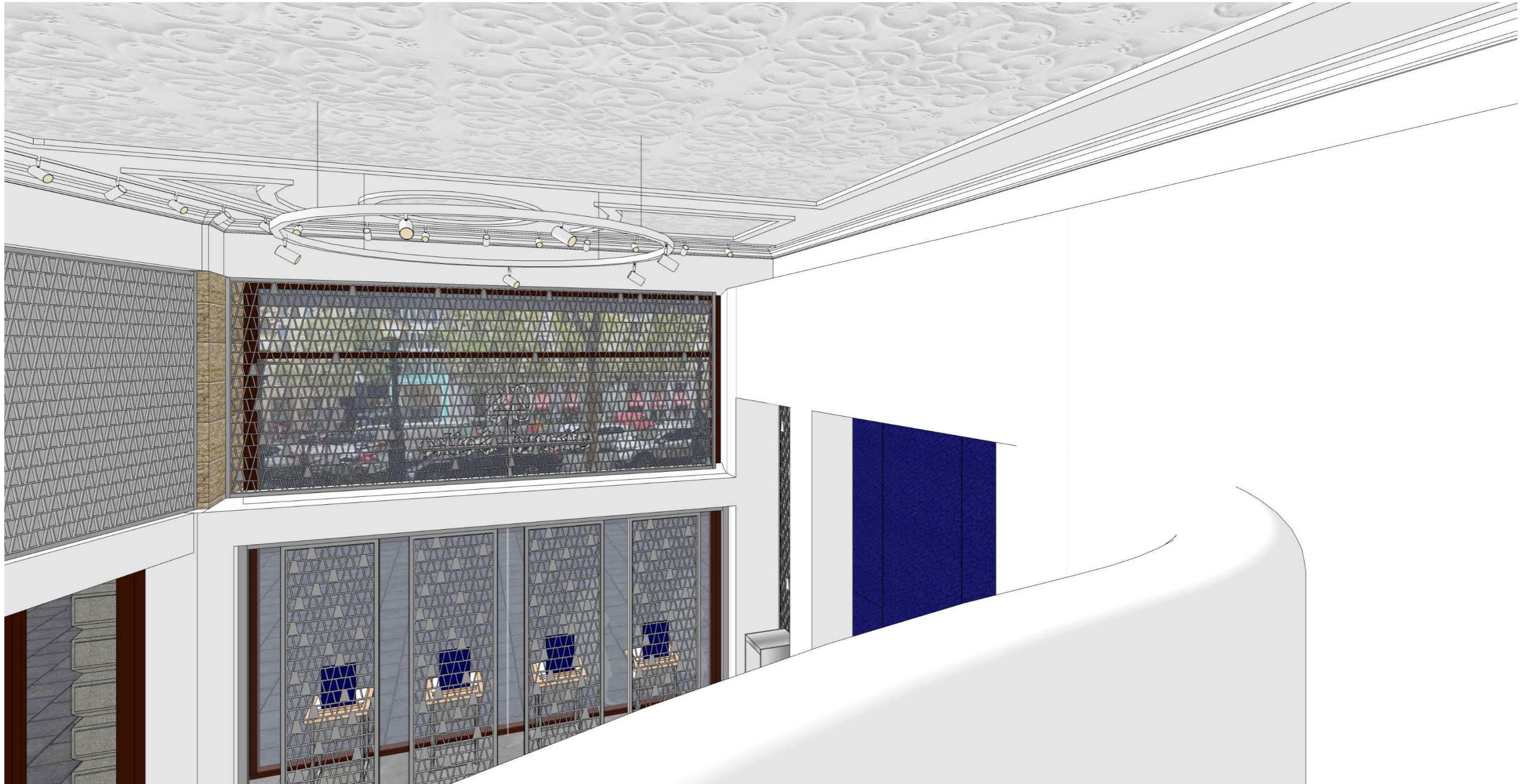
Internal Perspective – Mezzanine level

PROPOSED GRAND SEIKO BOUTIQUE HERITAGE VICTORIA ISSUE (REV A) – GF & MEZZ PERSPECTIVES SHOP 286 THE BLOCK ARCADE 282 COLLINS ST MELBOURNE VIC 12.07.2024