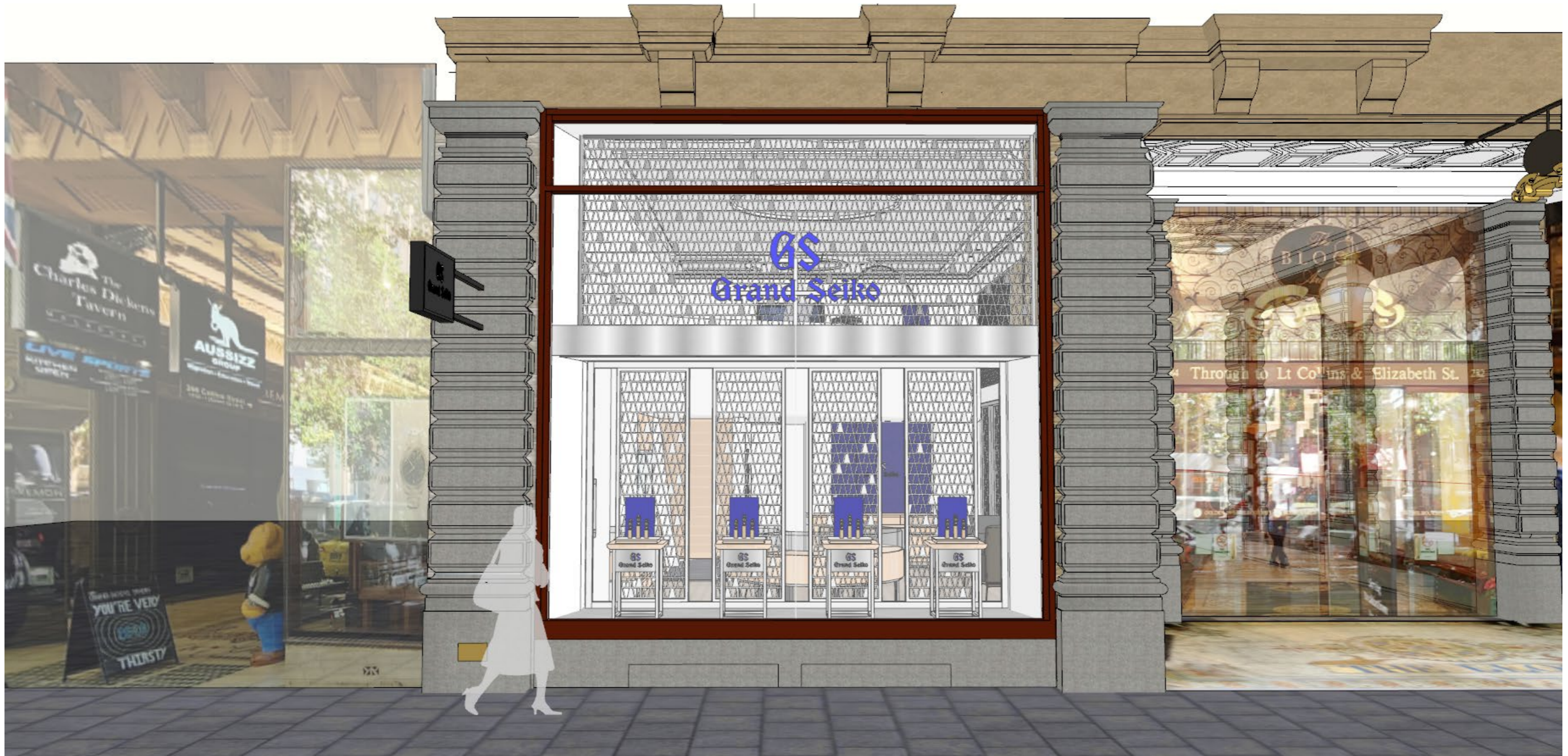
Shopfront Perspective – Display Window

PROPOSED GRAND SEIKO BOUTIQUE HERITAGE VICTORIA ISSUE (REV A) – GF & MEZZ PERSPECTIVES SHOP 286 THE BLOCK ARCADE 282 COLLINS ST MELBOURNE VIC 12.07.2024