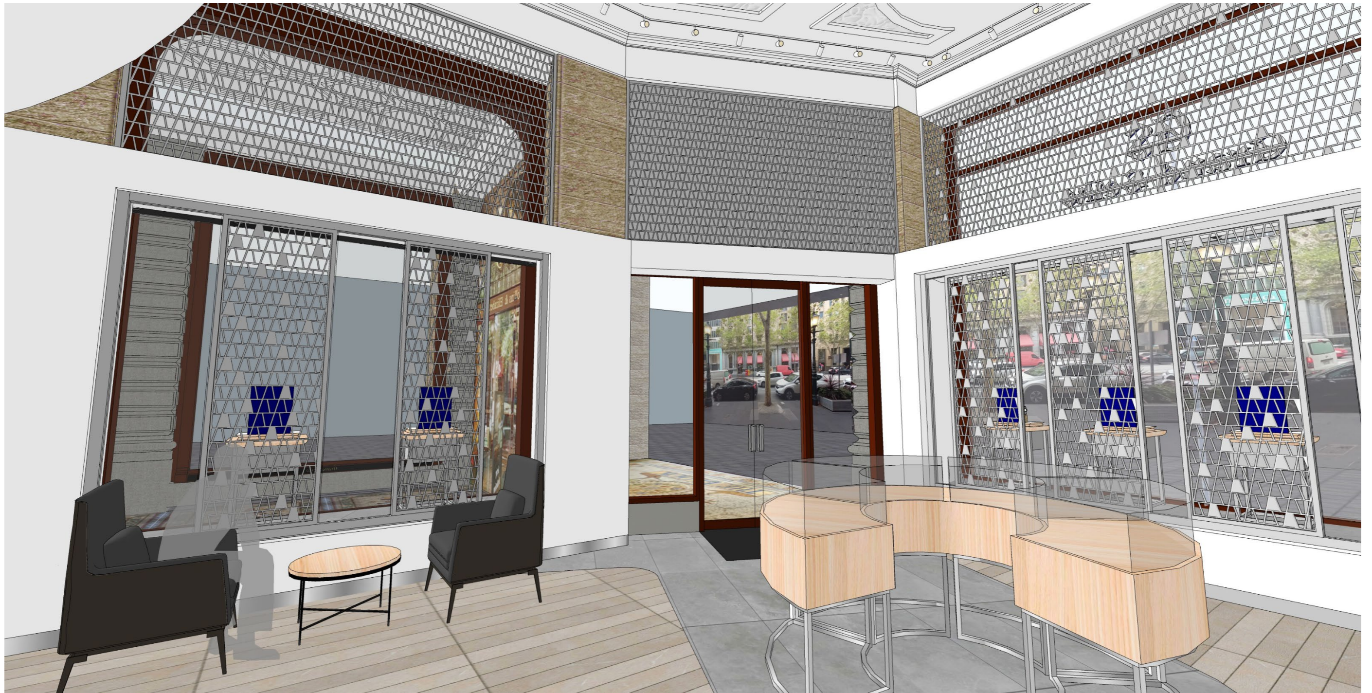
Internal Perspective – Rear of Shopfront

PROPOSED GRAND SEIKO BOUTIQUE HERITAGE VICTORIA ISSUE (REV A) – GF & MEZZ PERSPECTIVES SHOP 286 THE BLOCK ARCADE 282 COLLINS ST MELBOURNE VIC 12.07.2024