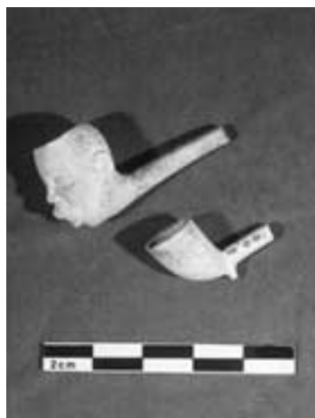
Kaolin pipes from Scotland, found at Cohen Place

Shipwrecks tell us much about the development of the State, reflecting immigration, transport, communication and trade patterns. The Reef to Cape study was an important component of recording and recognising the cultural importance of shipwrecks and making sure they're protected. The survey will also lead to the extension of the Great Ocean Road Historic Shipwreck Discovery Trail, which has proven to be a popular tourism drawcard.