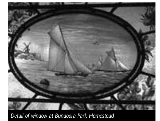
Detail of window at Bundoora Park Homestead

An opening in an existing wall has been made to create a bar space, and is to retain a minimum single brick width nib. A decorative ceiling with most of its cornices intact was also discovered behind a false ceiling and will be repaired.