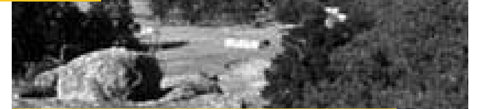
Patterns of settlement and farming are revealed in the broader scale landscape of Ercildoune, from its siting in relation to the nearby hill (foreground) to the clustering of the trees around the house, bordering the driveway, and in distant windbreak plantings.

The challenge now is to develop and agree on landscape conservation approaches for identifying, protecting and managing landscapes as heritage places. There is a need to balance special landscape heritage values with the practicalities of living and working in a sustainable way. Tourism pressures,