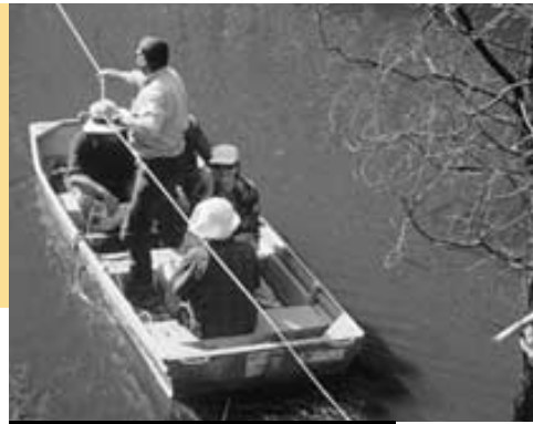
Regional Tour, Eldorado

The Heritage Council also spent time as guests of the Mornington Peninsula