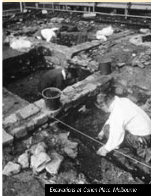
Excavations at Cohen Place, Melbourne

Excavations have been conducted on 10 different city sites, including the Queen Victoria Market, the Royal Mint, the new County Court site, and the Police Garage near the Old Melbourne Gaol.