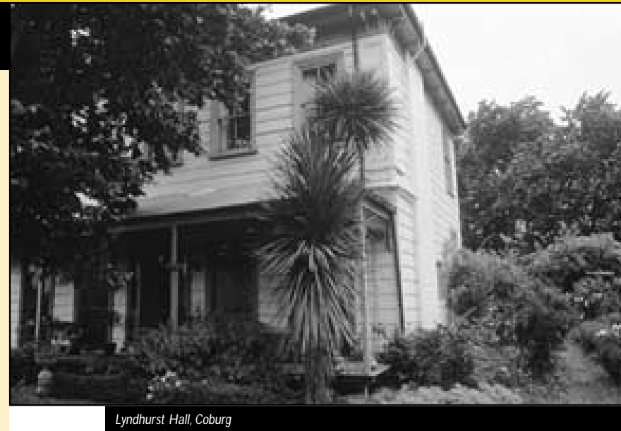
Lyndhurst Hall, Coburg

A look at some of the latest permits issued by Heritage Victoria.