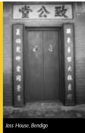
Joss House, Bendigo

The complete reports collection can be found at www.doi.vic.gov.au/heritage or viewed at the office of Heritage Victoria.