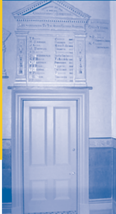
Careful removal has revealed these honour boards and painted banners.

First, ask yourself if it's really necessary. Stripping may remove interesting surfaces, and the wrong method can damage the fabric. In some cases it may be unjustified on historical or aesthetic grounds.